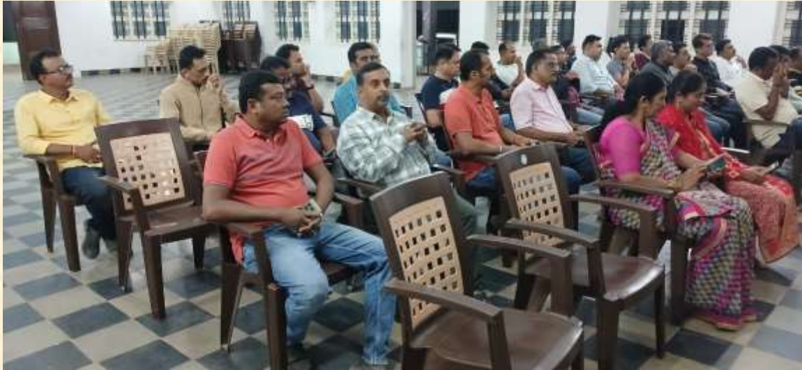
There was good attendance by the members.